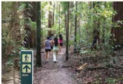
(Right) Pile Valley circuit; (far right) Be still and, like magic, Kreffts river turtles pop out of the tea-coloured waters as they swim past the Lake Allom viewing platform.

1.4km circuit. Class 2. Allow 1hr from Lake Allom day-use area (off Northern Forest scenic drive) An easy stroll with picture-perfect water reflections mirroring the towering brushbox and satinay trees. On warm days the air is scented with the spicy fragrance emitted by the leaves of the carrol shrubs that grow close to shore.