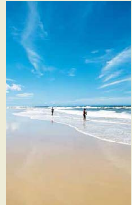
(Top banner) Traditional Butchulla welcome dance, performed as part of the determination celebration for Butchulla native title; (left) Fraser Island—sweeping landscapes and a beach that goes on forever.

Relax into island time and experience a getaway adventure on a sand island paradise. Fraser Island (K'gari), the world's largest sand island, has something for almost everyone. Discover exquisite views, treks over snow-white sandblows, and forest drives. Enjoy springtime wildflowers, lakes, beaches and wildlife. With so much to see and do you'll want to come back again and again.