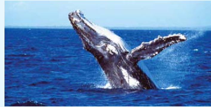
What diversity! Stingrays, sharks, dolphins, and in spring, whales cruising around Hervey Bay. Ranger Sven